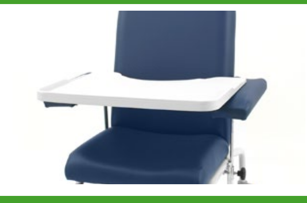
Table 60x47 cm wrap-around recess and folding edges Dx or Sx