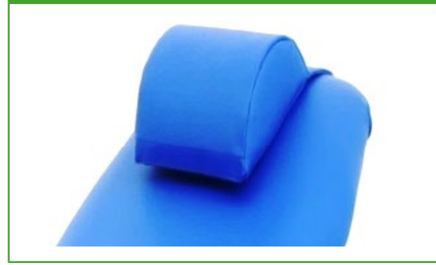
Headrest removable and adjustable by Velcro strap.